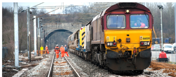
Leasing Companies (ROSCOs)