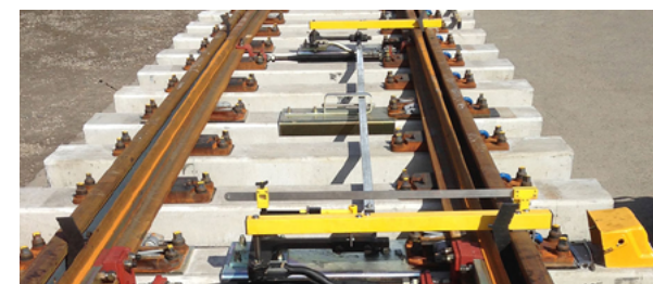
Rail Infrastructure Product Manufacturers and supply chain