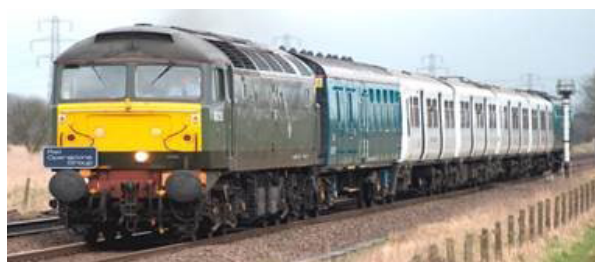
Train Operating Company Licence Holders (TOCs and FTOCs)