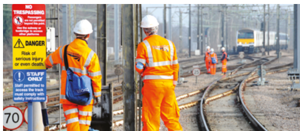
Trackside Contractors & Supply Chain (Civils/PWAY/Deveg/S&T/HV & LV including Labour Supply)