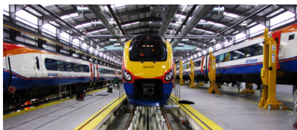
Rolling Stock Maintenance (Workshops, product suppliers and turnkey modifications installers)